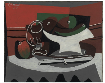
Pablo Picasso Still life [Nature morte] 1924 oil on canvas, Bequest of Saidie A May Baltimore Museum of Art