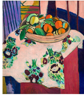
Henri Matisse. Still Life with Oranges (Nature morte aux oranges) 1912 oil on canvas. Musée Picasso, Paris