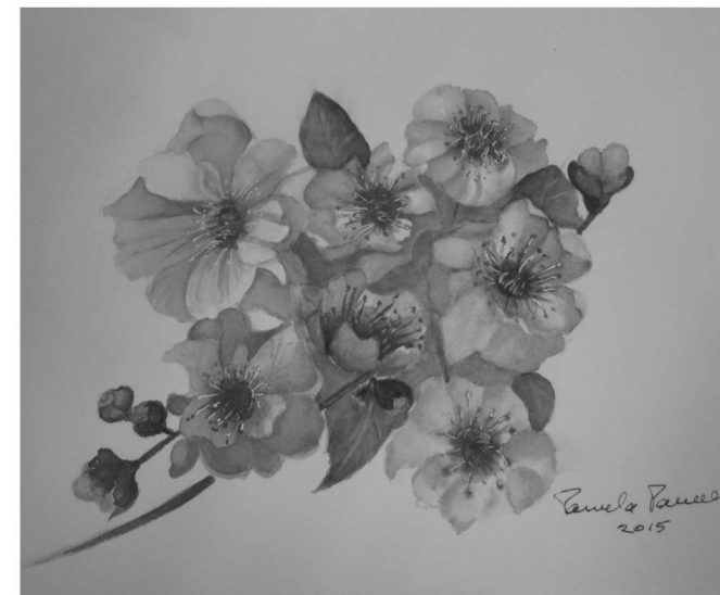
Flowers by Botanical Art teacher Pamela Powell

NEXT MEETING Tuesday 11th September 2018 7.30pm