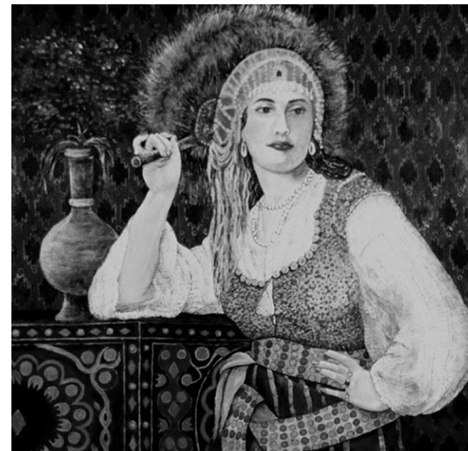
'Jewel of the Harem' by Virginia Wheatley

Registered by Australia Post Publication No. 243547 Volume 23 Issue 8 September 2016