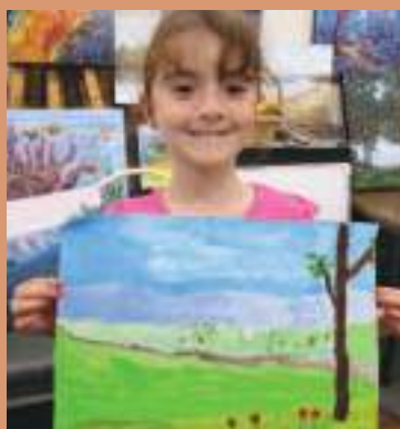
School Holiday workshop January - Paint a Landscape