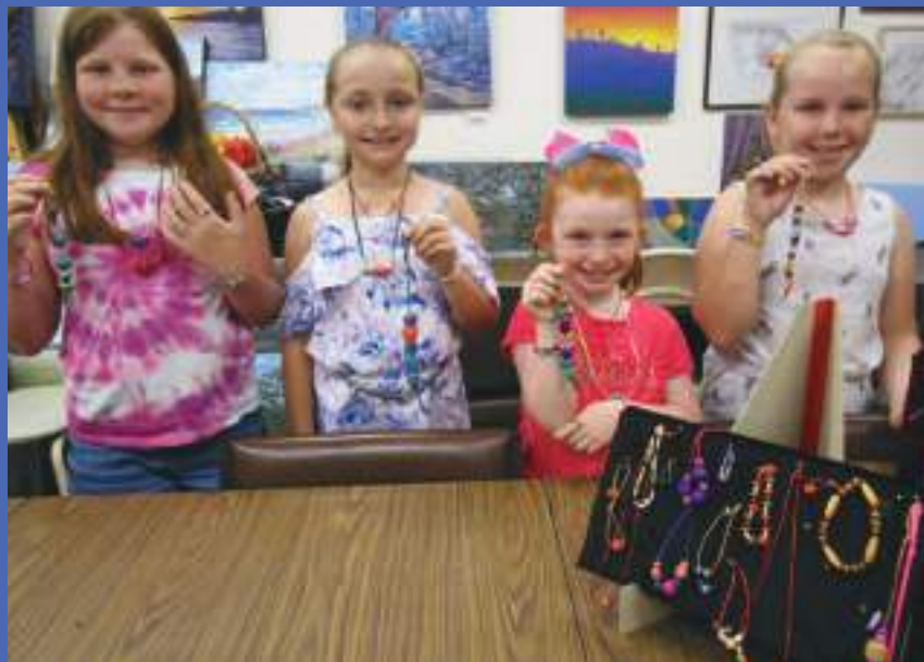
Left: Children with the jewellery they have made